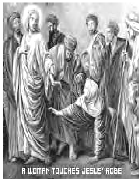
A WOMAN TOUCHES JESUS' ROBE